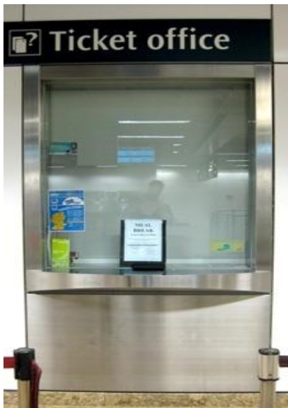
Transit Link Ticket Office

Transit Link Ticket Offices are located at selected stations. Please refer to the table at the end of this guide, or Transit Link's website for the list of Ticket Offices and their operating hours. Please do not approach the SMRT or SBS Transit's Passenger Service Centre to redeem the evouchers.