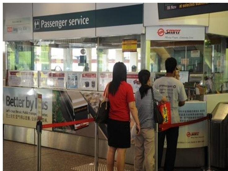
Passenger Service Centre