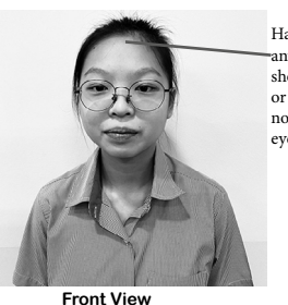
Hair fringe or any loose strands should be clipped or pinned so as not to touch the evebrows

Hair extending below the collar should be neatly tied up using only black, dark brown , or dark blue hair bands.